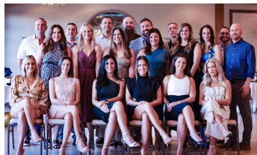
The Class of 2002 met on Aug 5/6th for their 20 year reunion.