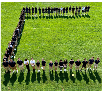
New student orientation