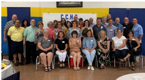
The Class of 1982 held their reunion the weekend of July 8/9th.

NON PROFIT ORG U.S. POSTAGE PAID MAILERS CHOICE