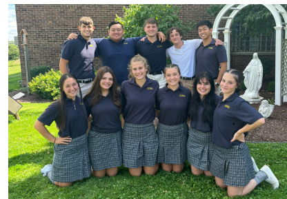
2022 Homecoming Court