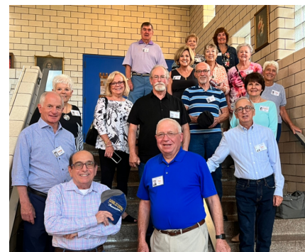
Class of 1965 met for their 75th birthday reunion on September 2/3rd.