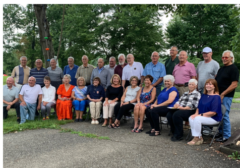
July 16th, the Class of 1967 celebrated their 55 year reunion.