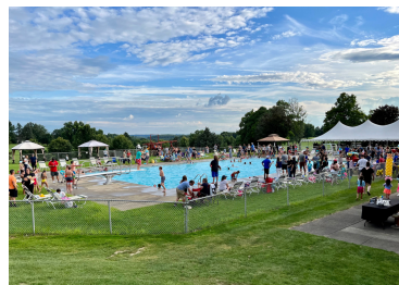
Elementary back to school pool party