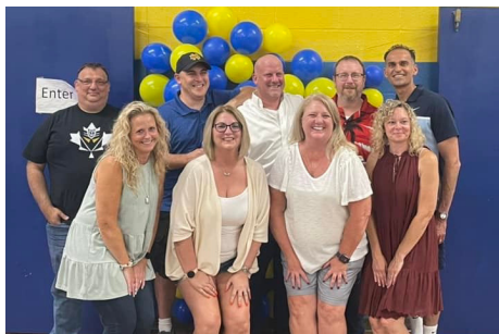
The Class of 1992 held their 30 year reunion on July 30th.