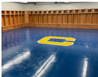
Newly upgraded athletic locker room